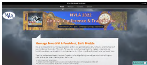
Desktop version of Conference App